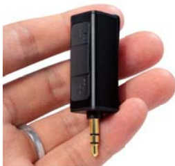
Super tiny only 55 x 15 x 15mm